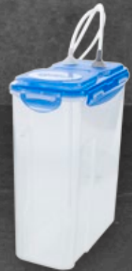
Included external water tank