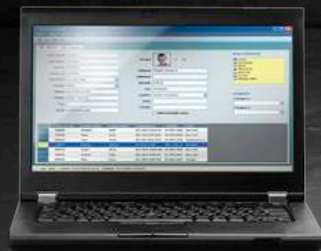
The OtoAccess™ database