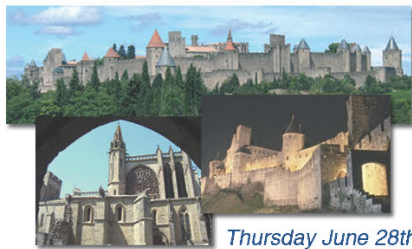
Thursday June 28th Cité de Carcassonne

Departure by bus from the Clinic More info and final program at: www.clinique-causse.com/course2017